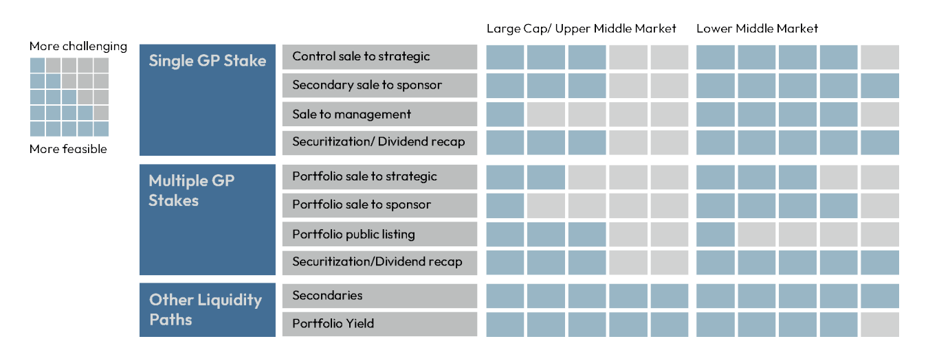
Exhibit 3: Multiple Forms of Liquidity<sup>4</sup>

Lower middle market GP stakes have a clear liquidity advantage relative to large cap and upper middle market GP stakes. This advantage is driven by the amount of capital required to purchase a GP stake of each type and the resultant impact on the universe of potential buyers. A portfolio of ownership interests in lower middle market sponsors is generally of sufficient scale to take advantage of interim financing options to pull forward distributions for limited partners while preserving upside optionality. Additionally, each position is still small enough to allow for either a sale back to management or a sale to a strategic or a larger GP stakes firm. By contrast, realizing an exit is more challenging for large cap and upper middle market GP stakes firms given the sheer quantum of capital necessary to consummate a single stake let alone a portfolio level sale. These firms have raised multi-billion dollar vehicles and pay hundreds of millions of dollars for individual stakes; as a result, to provide portfolio level liquidity, it is likely that these firms will need to access capital via an IPO or through a large structured note.